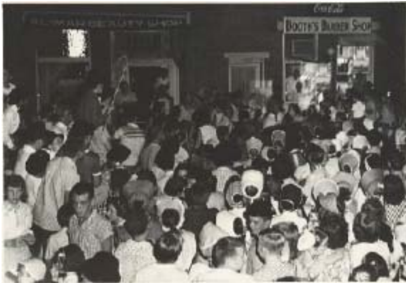
Residents gather on State Street to celebrate town's 100th birthday.