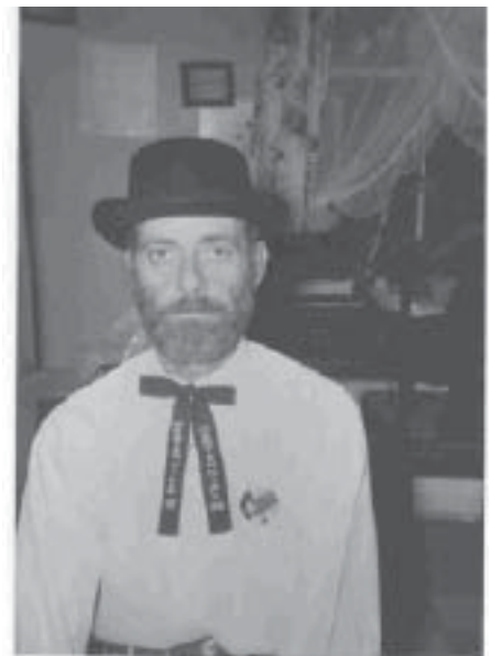
A "Wester-villain" Brother of the Brush sporting his beard and bow tie.