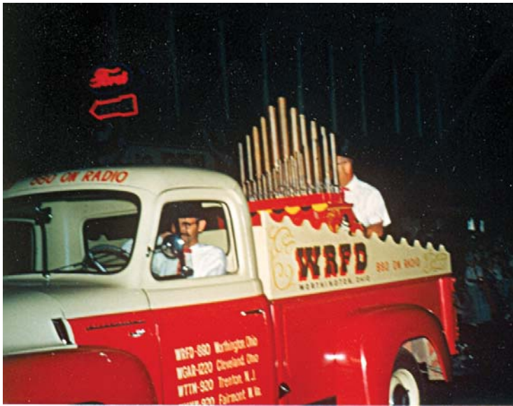
WRFD radio station calliope in parade.