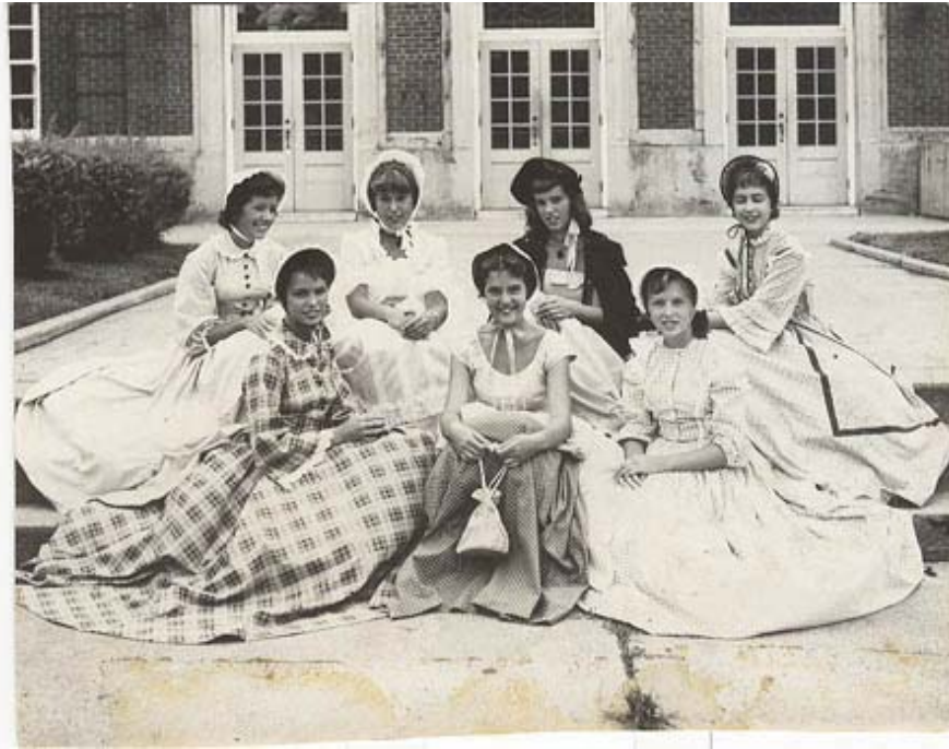
Centennial Celebration Queen and her court in front of Westerville High School.