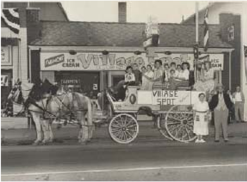
Parade wagon on State Street.